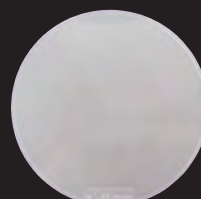
Permanent Metal Filter